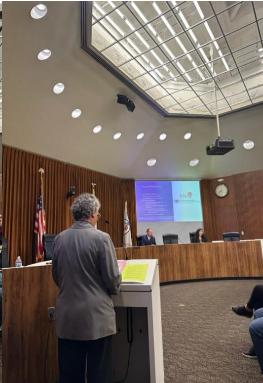
SB County 4th District Supervisor Candidate Forum 2/1/24