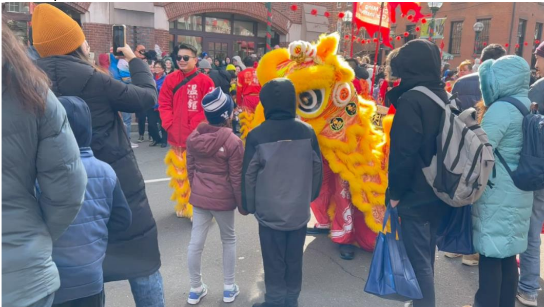
*Lion Dance from the Lunar New Year celebration in New Haven, CT 2/24/24 on a cold wintery day

On a personal note, many of you may know I am in New Haven, CT for the time being. Our daughter was hospitalized with an adverse reaction to an anti-anxiety medication she was prescribed. She was released and is recovering. I appreciate all the positive thoughts sent her way on her rapid recovery.