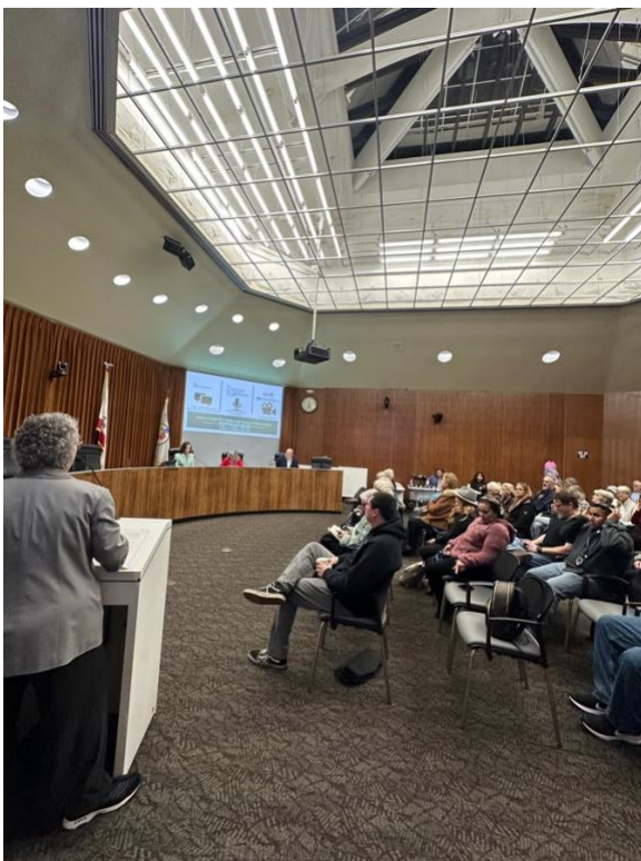
SB County 3 rd District Supervisor Candidate Forum 2/1/24