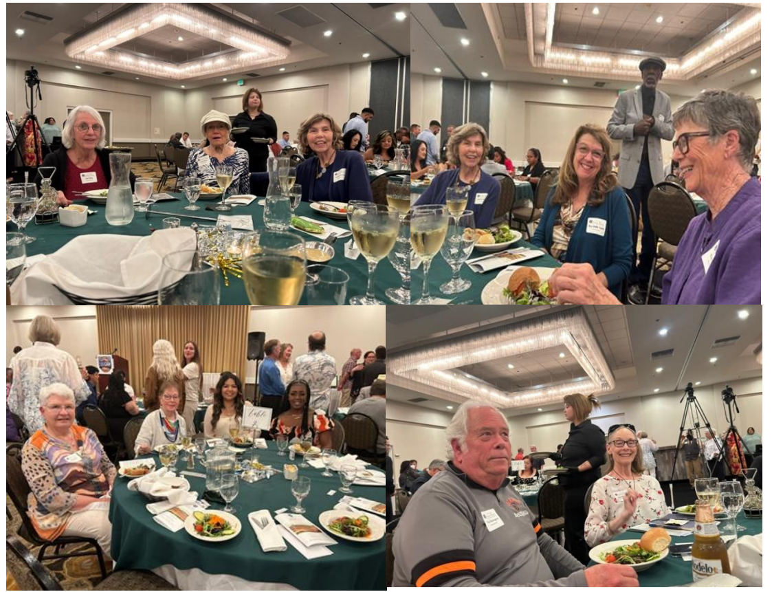
AAUW Lompoc-Vandenberg honored by SB Community Action Network with the "Giving Back" award.

AAUW Lompoc-Vandenberg's local programs were honored by the Santa Barbara Community Action Network with the Giving Back Award. The award was presented at the recent North County Looking Forward Annual Awards Dinner.